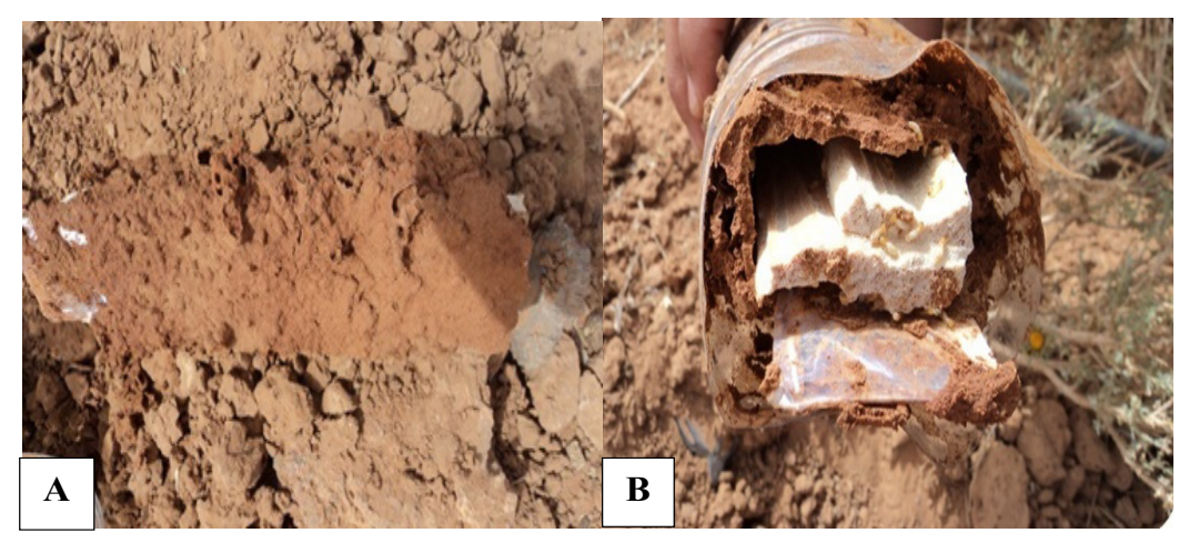
Figure 2 . (A) Samples exposed to termite attack for four weeks; (B) Positive trapping of wood attacked by termite after four weeks.